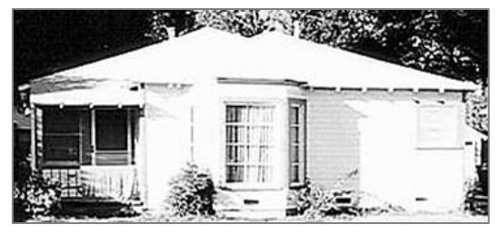
FIRST MEETING PLACE ON CLARK STREET