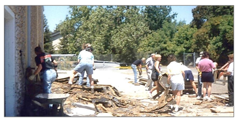
DEMOLITION AND CLEANUP BEGINS AT THE FORMER SKATING RINK