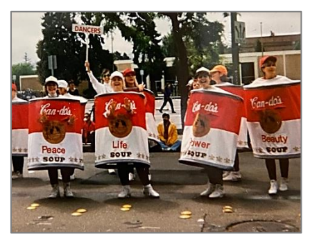
DANCING SOUP CANS ON PARADE

To celebrate the joy of living a spiritual life and to acquaint others with our ministries, we have participated in neighborhood events such as the Rose Parade (shown here).