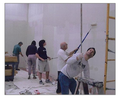
VOLUNTEER PAINTING CREW